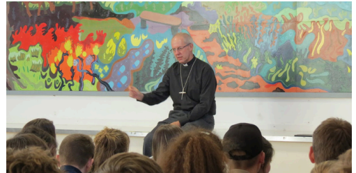
The Archbishop of Canterbury during his last visit to the diocese in 2016

“I am always struck by how many people, even if they are not regular